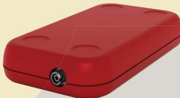
PErL Er-doped fiber laser system