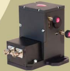
OG8/1 pulse picker with control unit