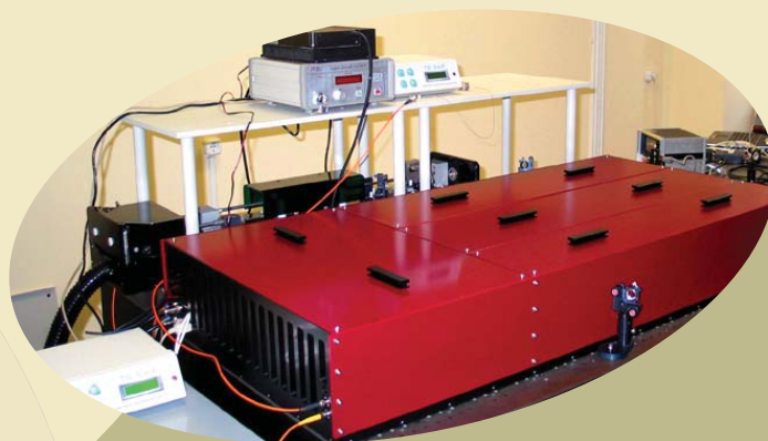
Cr:Forsterite regenerative amplifier FREGAT-200