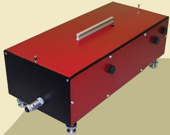
Third harmonic generator ATsG