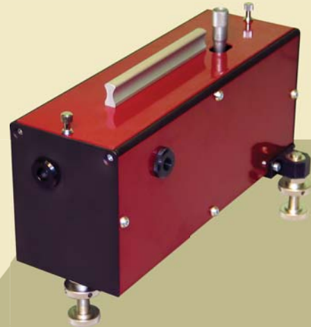
Second harmonic generator ASG